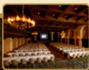
MEETINGS & EVENTS

Enjoy monthly specials at all our award winning restaurants