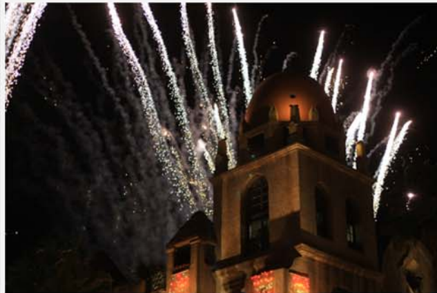
More than 3.6 million lights illuminate the historic hotel for the holiday season through Jan. 8.

A musical pre-show was provided by the Riverside City College Marching Tigers, and holiday music began after the lighting ceremony with the Factory Tuned Band headlining the main stage.